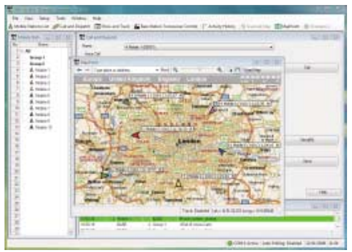
AVL (MapPoint®) Screen