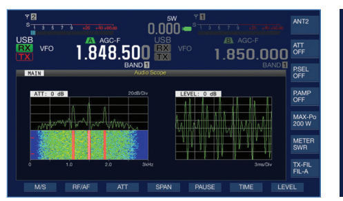
AF scope screen.

microphones. The SP-990 external speaker accessory is useful, particularly if the radio is set into a console or has other units on top. It only has a single speaker but includes additional audio tailoring. The instruction manual is huge and although written in a compact style, there are so many features and functions to describe that it runs to nearly 300 pages. Generally it is fairly clear and quite a triumph of writing in itself. At the time of this review, manual revisions were still on-going prior to release of the final version. There are no technical descriptions but circuit diagrams are provided and a separate PC Control Command reference manual is available downloadable from the Kenwood website. Here can also be found updated versions of the instruction manual, firmware upgrades and other relevant software. Another useful website for information is the G3NRW TS-990S Resources Page.