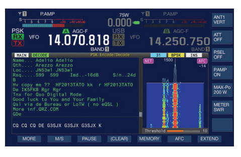
PSK decoder screen.

DATAMODES. The TS-990S includes fully featured built-in encoders and decoders for RTTY and PSK operation. Unlike many radios where this feature is provided, but rather simplistically, the higher resolution display in the TS-990S together with an external keyboard connected makes real operation much more feasible and enjoyable. The main screen in extended mode allows for 12 lines