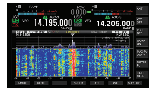
Main display with bandscope and waterfall.

The main receiver uses a switching first mixer and 15 input bandpass filters to cover the total frequency range, relay-switched on the five key bands and diode-switched on the remainder. A tuneable preselector may also be enabled to further reduce out of band signals. The sub receiver uses a quad arrangement of MOSFETs in both first mixer signal paths together with 13 diode-switched bandpass filters. Both receivers use switchable bipolar preamplifiers in the front end with nominally 12dB gain up to 21.5MHz and 20dB gain above and switchable attenuators for really strong signal situations. The local oscillator feed for the main receiver uses a PLL / DDS