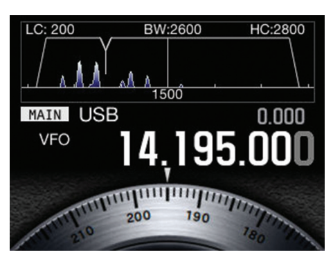
Sub display showing IF bandwidth and notch.

The voice guide provides voice readout of the status of various radio settings depending on how it has been set up. This includes the frequency, meter readings and virtually any other settings and key presses, and can be a great help for those with impaired vision. If not needed, the voice guide access keys can be used as programmable function keys.