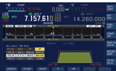
IF filter set-up screen.

For retro addicts or those with fond memories of the tuning scales of the past, the smaller display can emulate the dial ring of an analogue mechanical drive and, in SWL mode, the main display can emulate