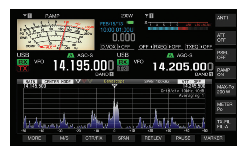
Main display with bandscope.

A separate quick access memory is included, with up to 10 channels stored. The usual comprehensive scanning is provided between frequency limits, across memory channels or groups. Three AGC speeds are selectable, each with a programmable decay time constant; AGC can also be switched off.