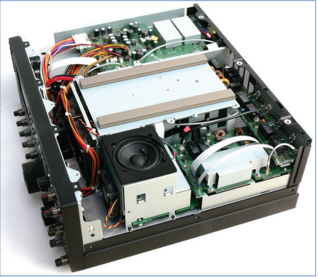
Kenwood TS-990S with cover removed.

drive output is also provided giving about 1mW transmit signal on the 136kHz band as well as transverter drive from any of the HF bands. As with the TS-590S, the low level LF transmit range can be extended to cover 100 – 522kHz with a dealer modification, useful for the 475kHz allocation.