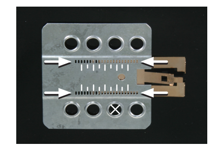
The position of the copper coloured holder can be adjusted to your needs for perfect fit. (see sample)