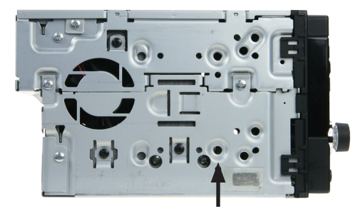
Mount the metal brackets with the double DIN head unit