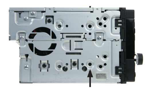
Mount the metal brackets with the double DIN head unit