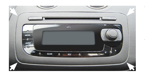
Special tools like radio release keys may be required.