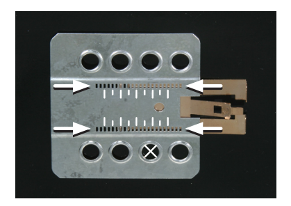
The position of the copper coloured holder can be adjusted to your needs for perfect fit. (see sample)